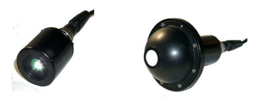
LED Light Module